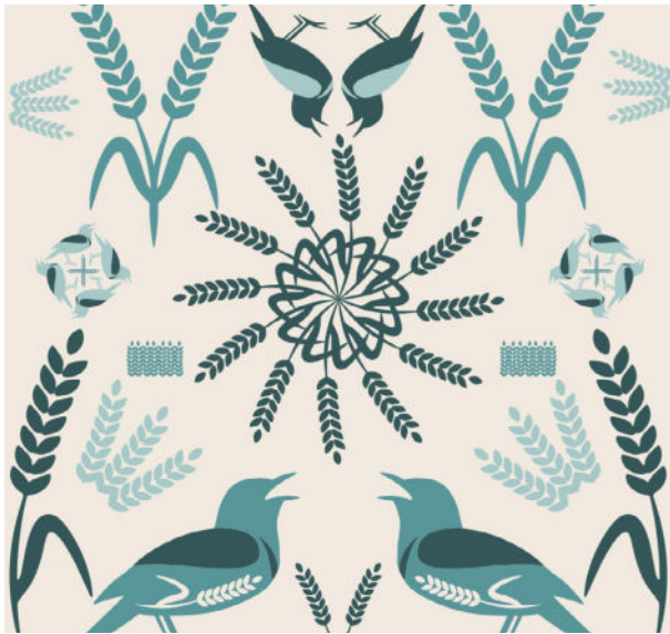
Organic Milled Grains Meadowlark Organics - Wisconsin Visit their online store here

For the food lovers in your life, gifts grown by Iroquois Valley farmers