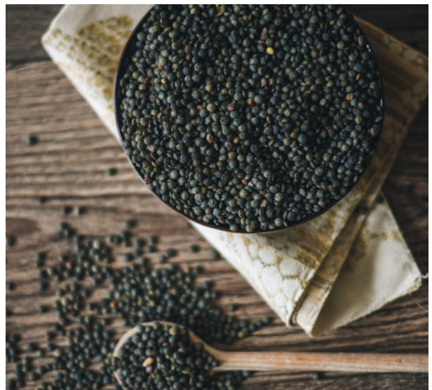
Organic Black Beluga Lentils Vilicus Farms - Montana Visit the Timeless Foods online store here