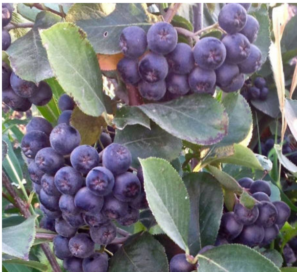
Chocolate Freeze Dried Aronia Berries Boone County Organics - Iowa Visit their online store here