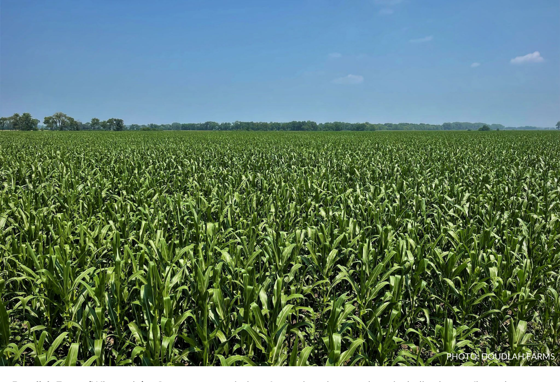
Doudlah Farms (Wisconsin) – Over twenty varieties of organic artisan products including beans, flours, honey, and sunflower seeds. Check out the farm's story and their products <u>here</u>.