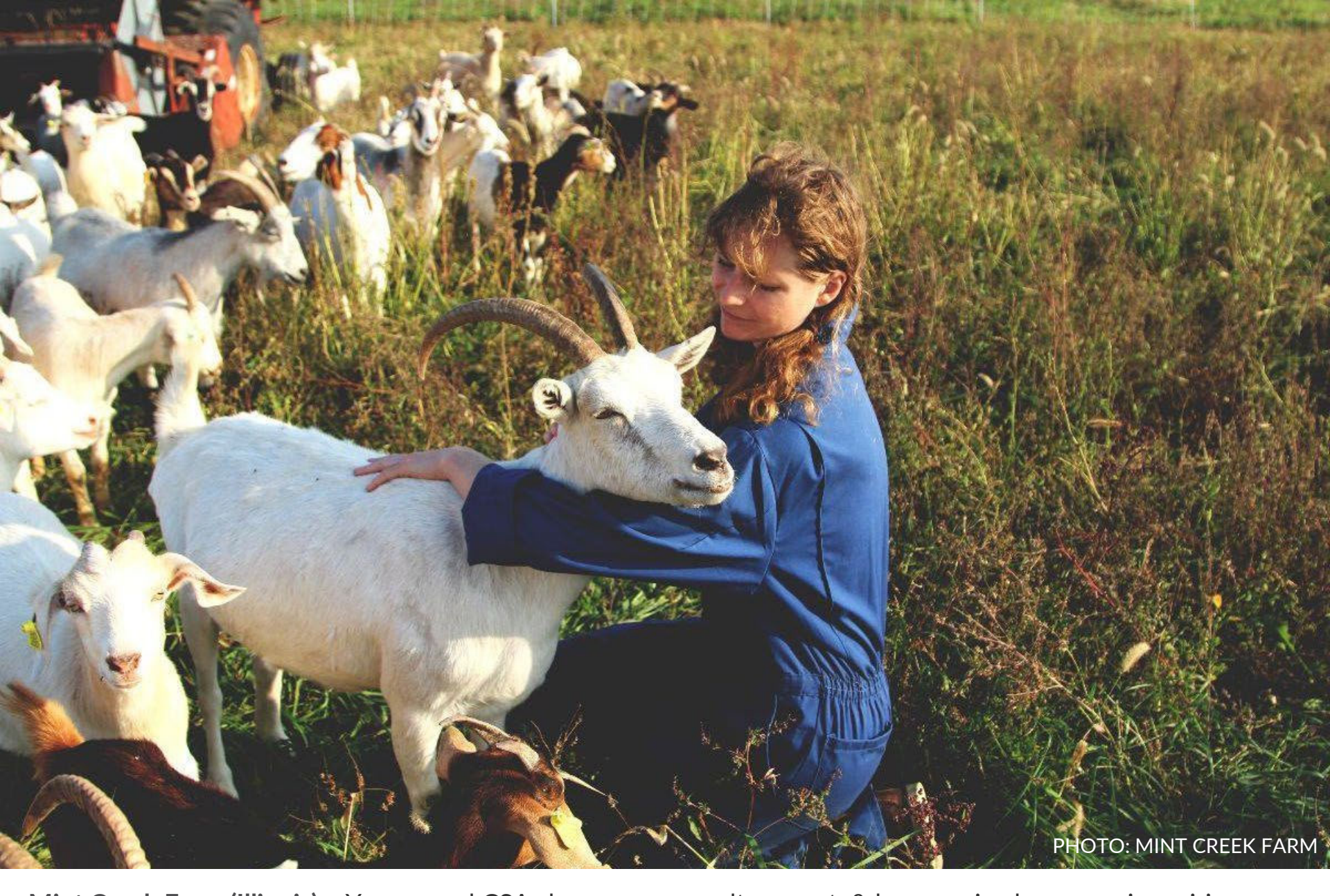
Mint Creek Farm (Illinois) – Year-round CSA shares, eggs, poultry, meat, & honey raised on organic prairie pastures. Holiday meat cuts include lamb, beef, pork, and boar. Visit their online store <a href="here">here</a>. Products are available for home delivery or local pick-up.