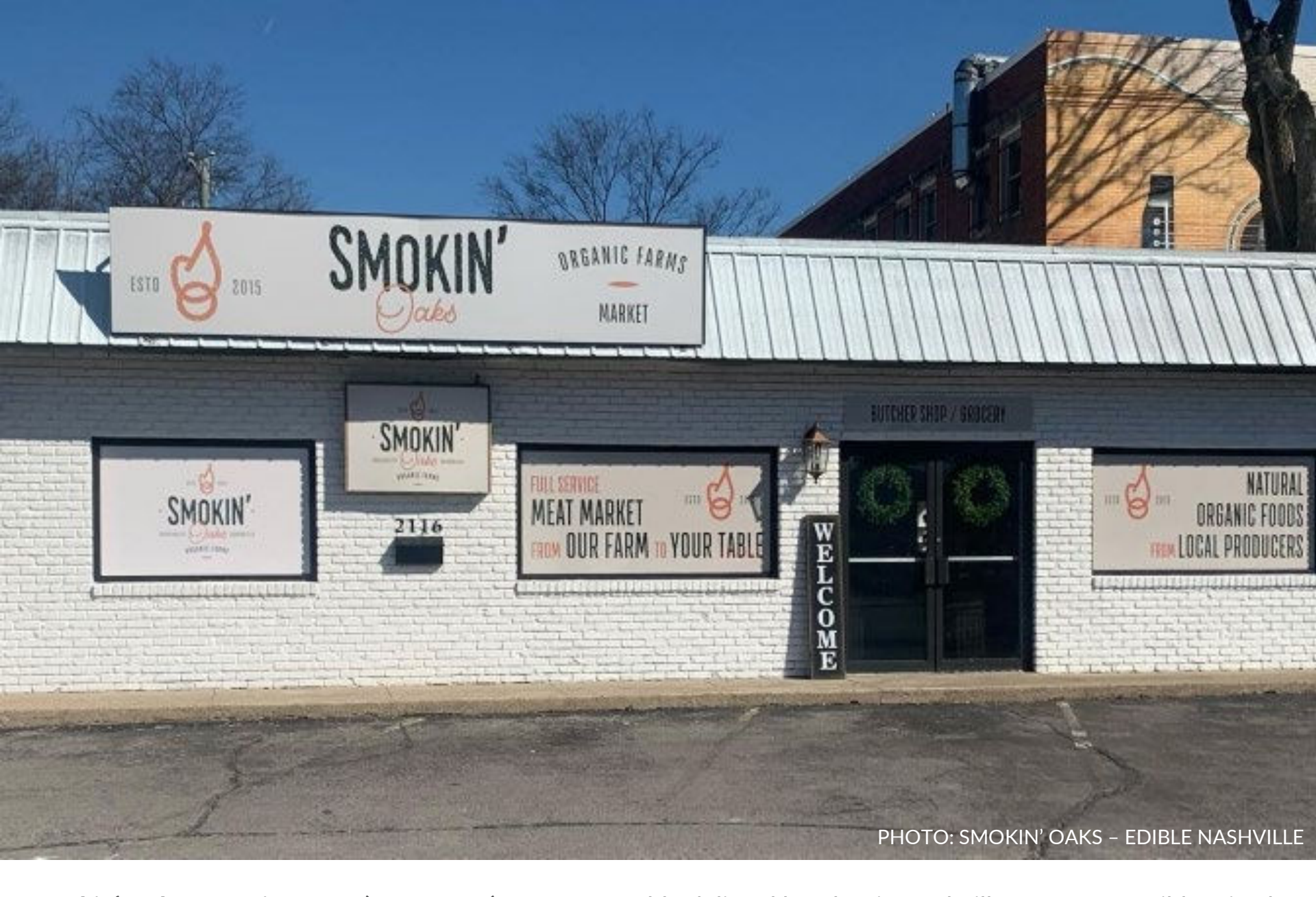
Smokin' Oaks Organics Farm (Tennessee) – Farm-to-table deli and butcher in Nashville, TN. Responsibly raised meat on pasture, in addition to local grains. Delivery in Nashville coming soon. Follow along on the website <u>here.</u>