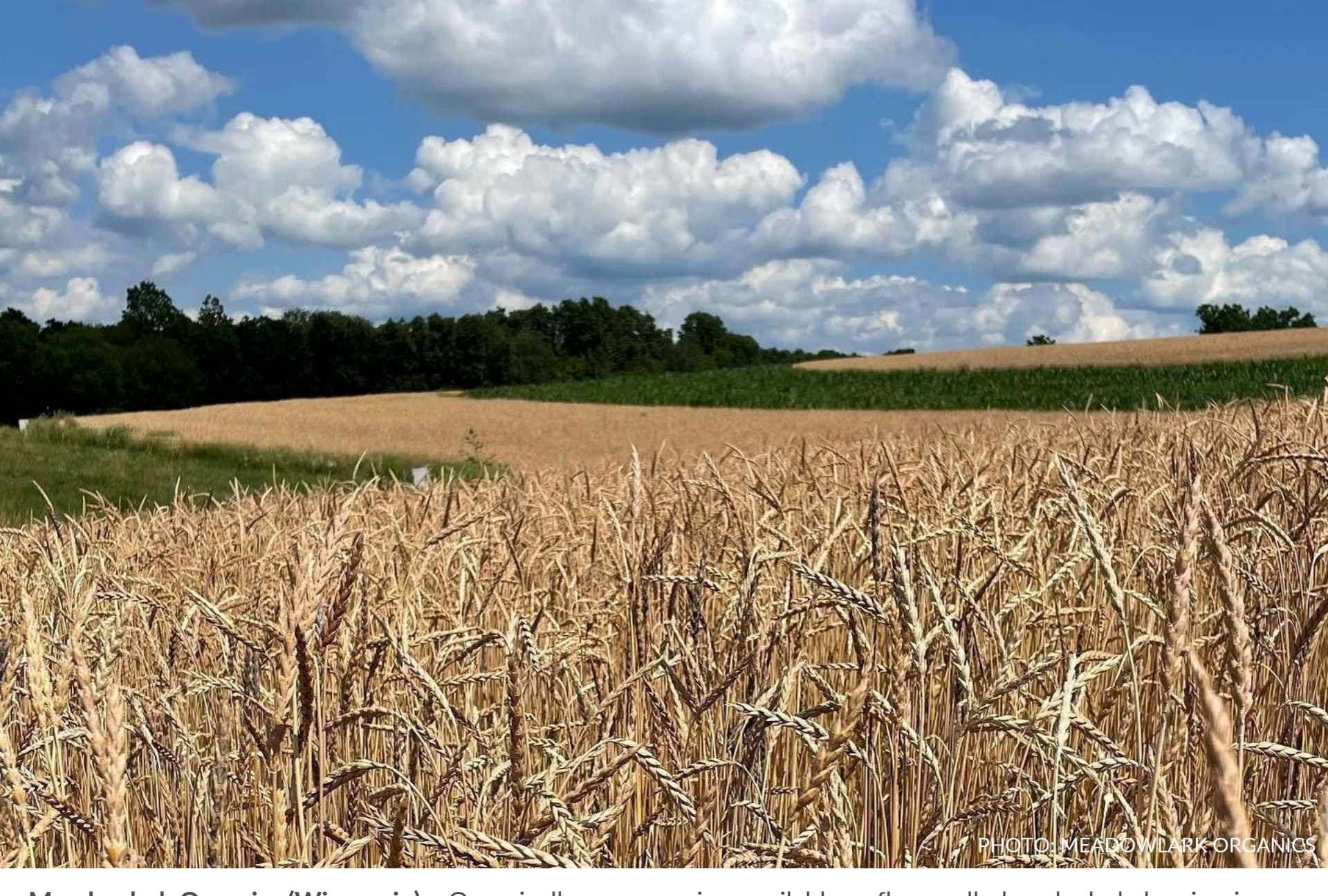
Meadowlark Organics (Wisconsin) – Organically grown grains, available as flour, rolled, and whole berries, in addition to heirloom dry beans. Grain shares also available for local pick-up and shipping. Visit their online store here .