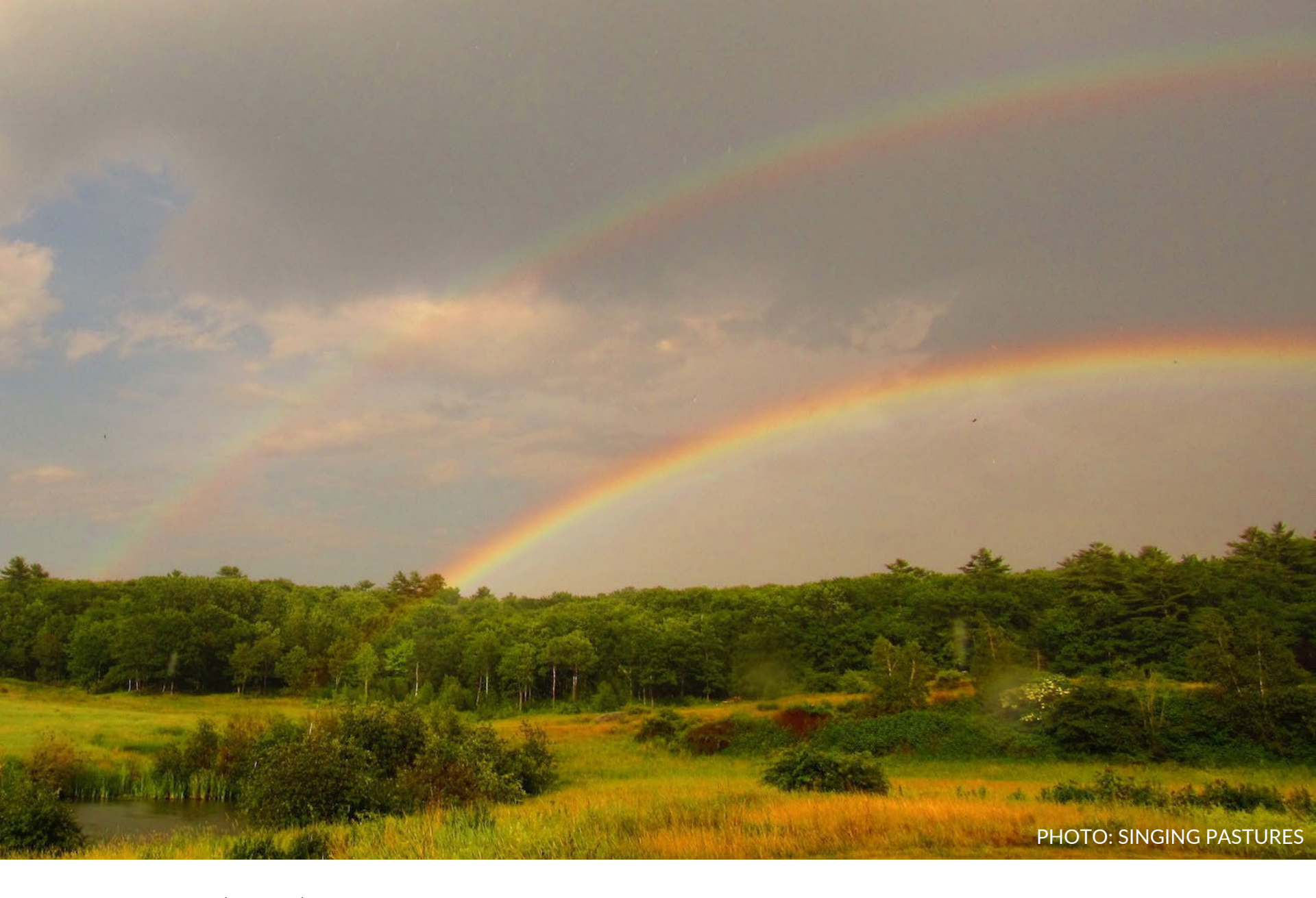
Singing Pastures (Maine) – Charcuterie and roam sticks made from heritage pork raised on organic pastures. Visit their online store <u>here</u>.