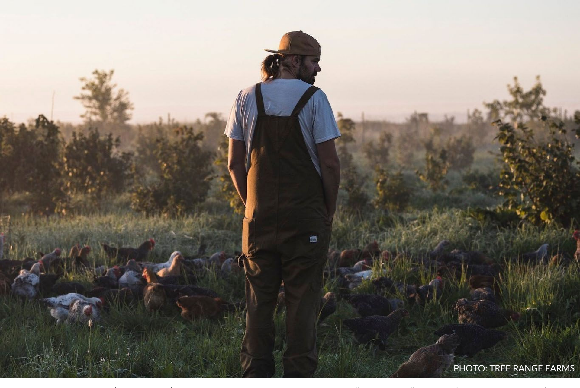
Tree-Range® Farms (Minnesota) – Regeneratively raised chicken in a "jungle-like" habitat (forested pastures) that allow them to forage on plants and bugs. Shipping available through the Upper Midwest, in addition to options at various markets in Minnesota. Visit the website <u>here.</u>