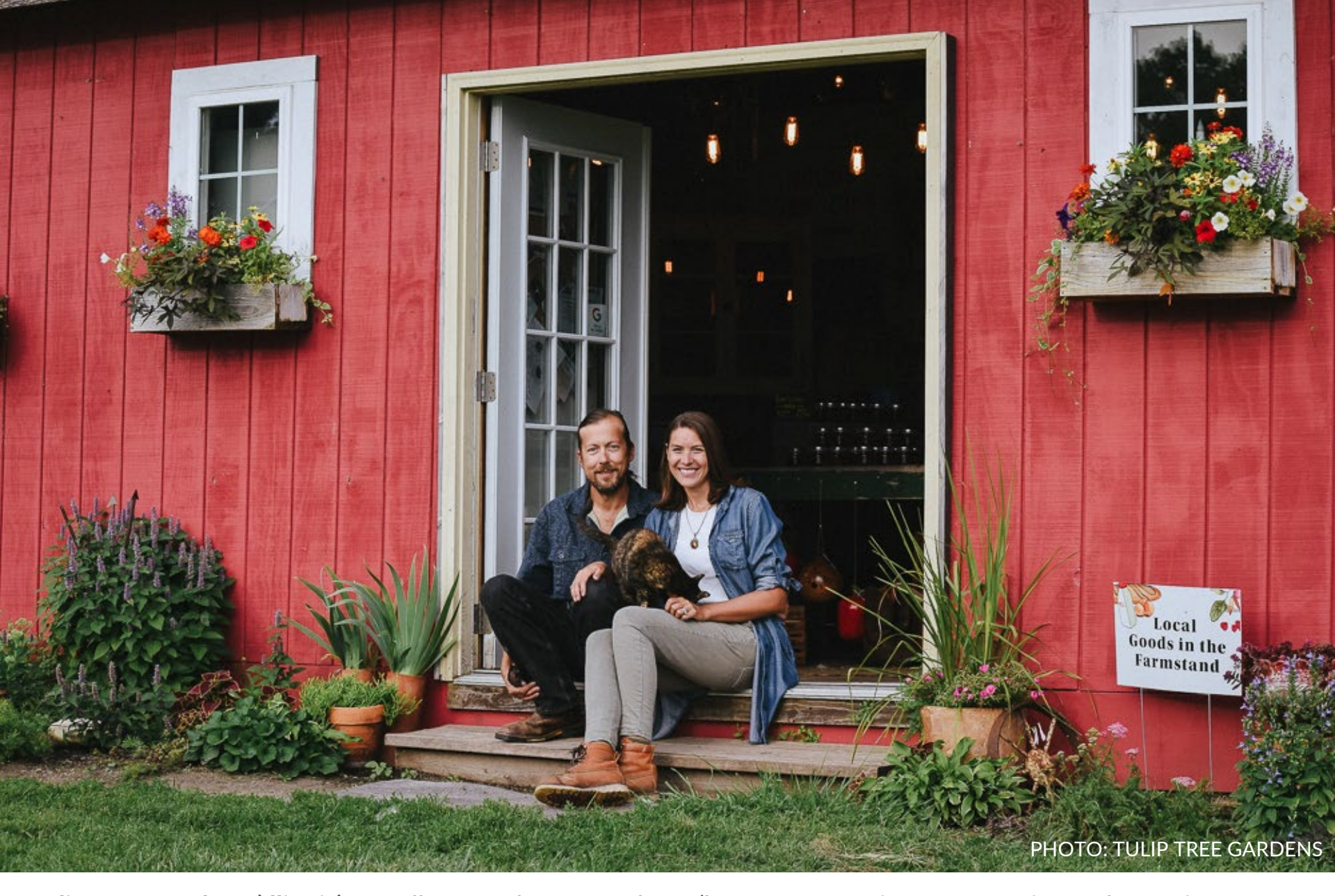
Tulip Tree Gardens (Illinois) – Wellness and CBD products (hemp grown using regenerative and organic practices) available <u>here</u>. Farmstand products, such as eggs, honey, milk, and meats are also for sale via the <u>online farmstand</u> (local pick-up only).