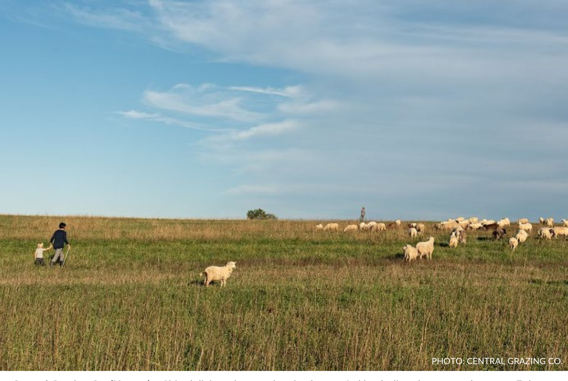
Central Grazing Co. (Kansas) – Ship delicious, humanely raised grass-fed lamb directly to your doorstep. Enjoy your lamb meat knowing that Central Grazing cares about animals, our planet, and improving the livelihoods of farmers in the Heartland. Check out the website here.