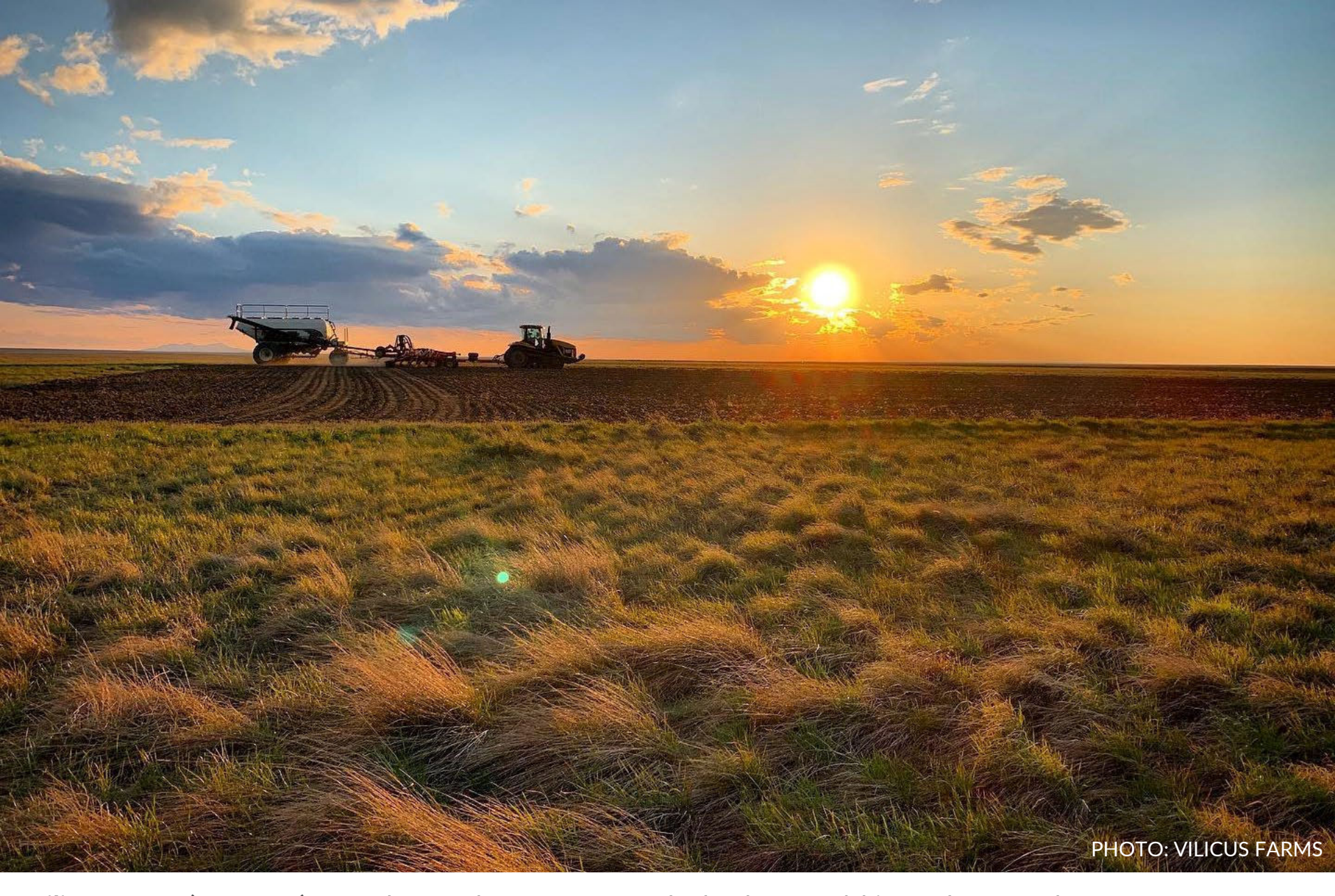
Vilicus Farms (Montana) – Purchase a share to support the land stewardship work across the 12,508 acres of Vilicus Farms through their <u>Community Supported Stewardship Agriculture (CSSA)</u>. <u>Timeless Seeds</u> (shipping available) and <u>Glacier Distilling</u> (local stores only) also sell products grown by Vilicus Farms.