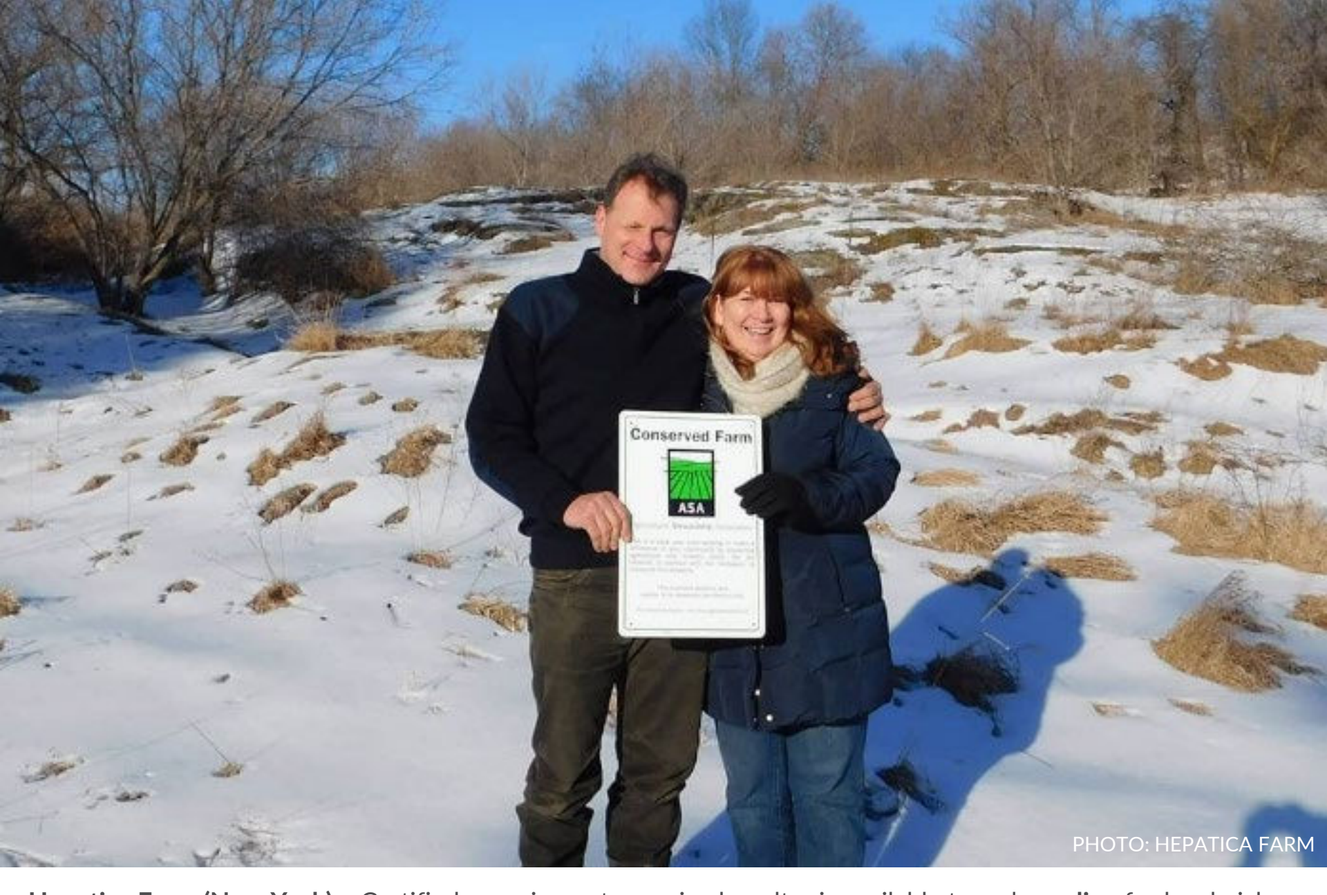
Hepatica Farm (New York) – Certified organic, pasture-raised poultry is available to order <u>online</u> for local pickup as bundles, whole birds, or individual cuts. The birds live outdoors on fresh grass, inhale clean air, and bathe in sunlight. To reduce impact on the climate, feed is locally sourced (Hudson Valley).