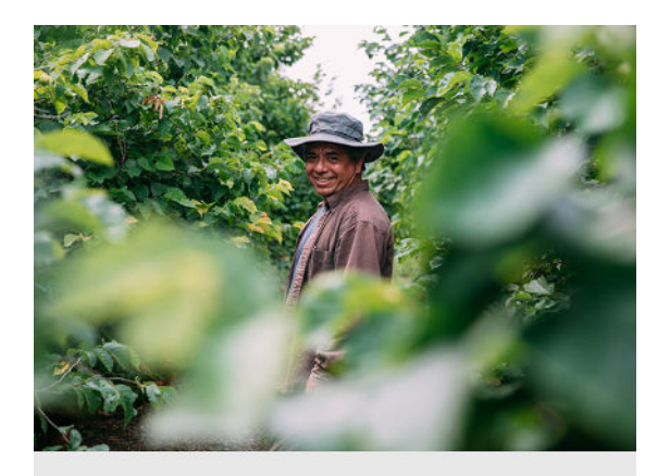
Support Indigenous Farmers in the Midwest

Iroquois Valley is the sole member of Healing Soils Foundation (HSF), a non-profit 501(c)(3) charitable organization that offers grants to farmers committed to restoring and regenerating soil health.