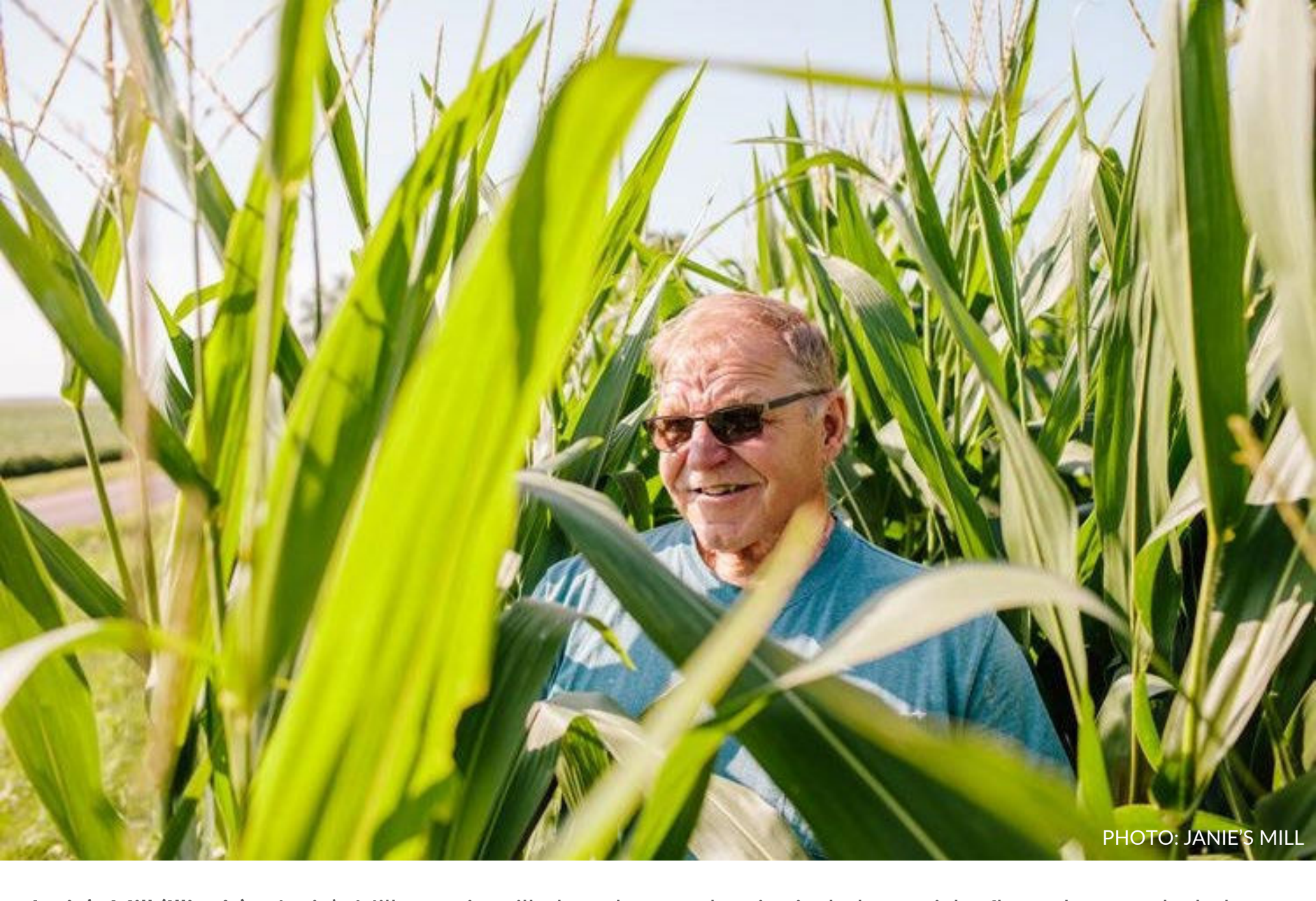
Janie's Mill (Illinois) – Janie's Mill organic-milled products and grains include specialty flours, bran, and whole wheat berries. Visit their online store <u>here</u>. Make sure to check out their <u>recipes</u> for baking with heirloom grains.