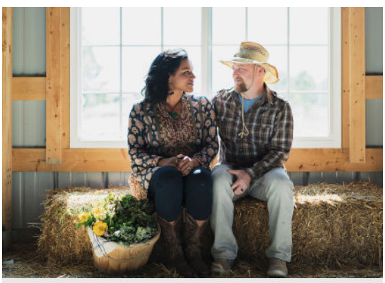
Assist Socially Disadvantaged Farmers with Land Access