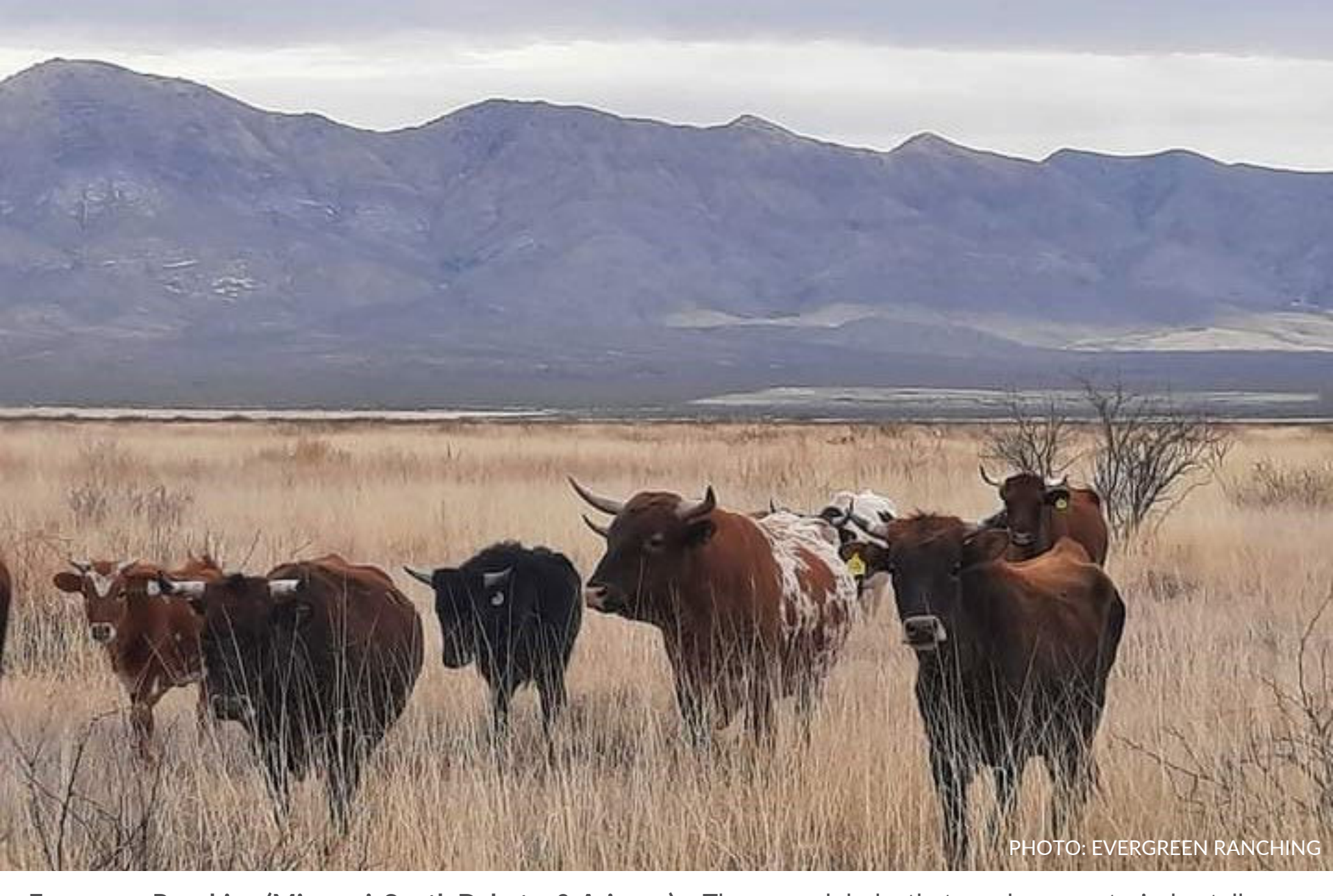
Evergreen Ranching (Missouri, South Dakota, & Arizona) – Three ranch hubs that produce meats, jerky, tallow, lard, bone broth, and raw dog food / dog treats. If you are looking for something for yourself or your furry friend, shop their online store <u>here</u>. Items are also available for pick-up in Rapid City, SD and Sturgis, SD.