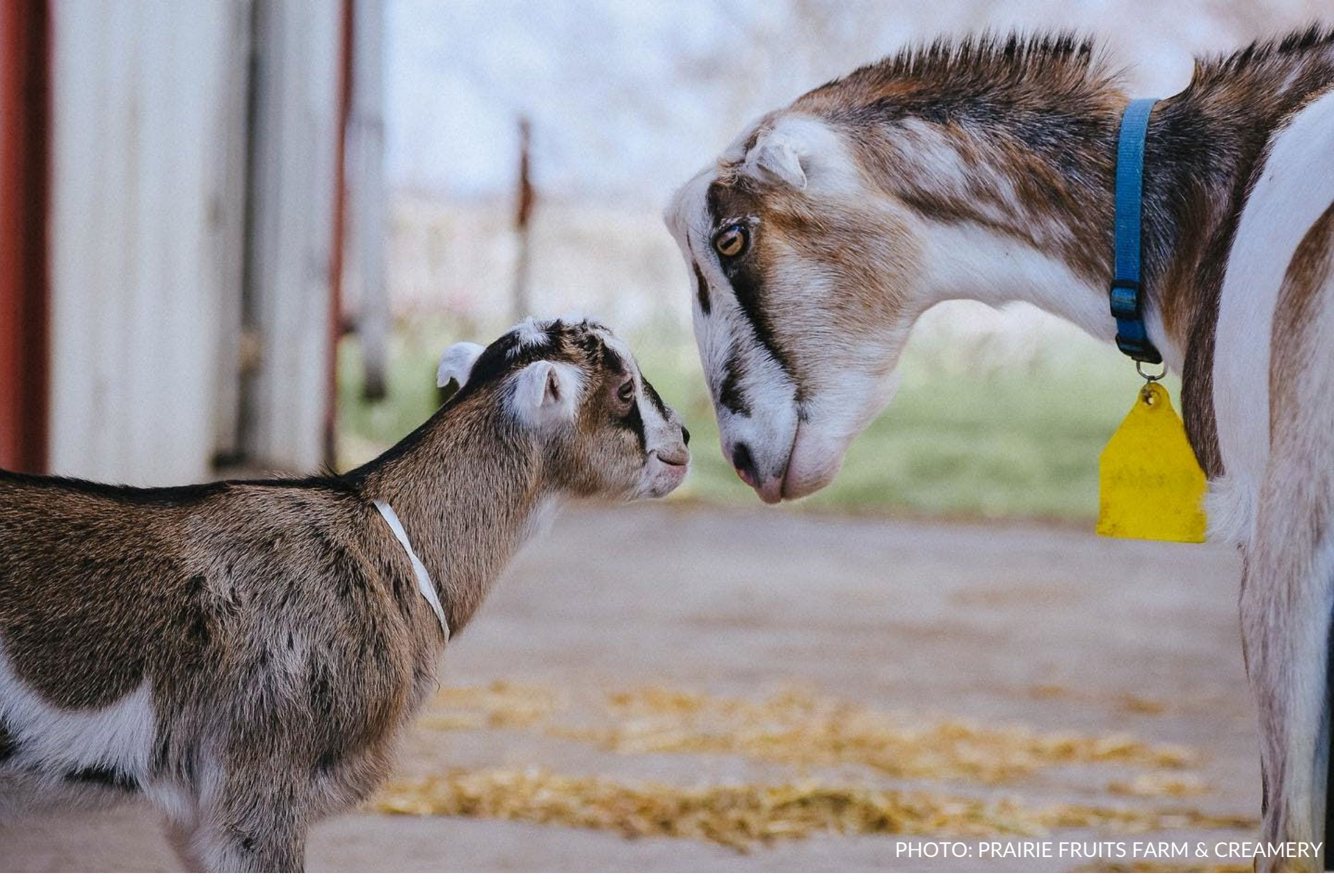
Prairie Fruits Farm & Creamery (Illinois) – Goat cheese and dairy products, including gift boxes. Visit their online store <u>here</u>. Goats are raised in a silvopasture system that incorporates fruit trees and bushes that also flavor some of the products. Note: some products only available for pick-up at their farmstand.