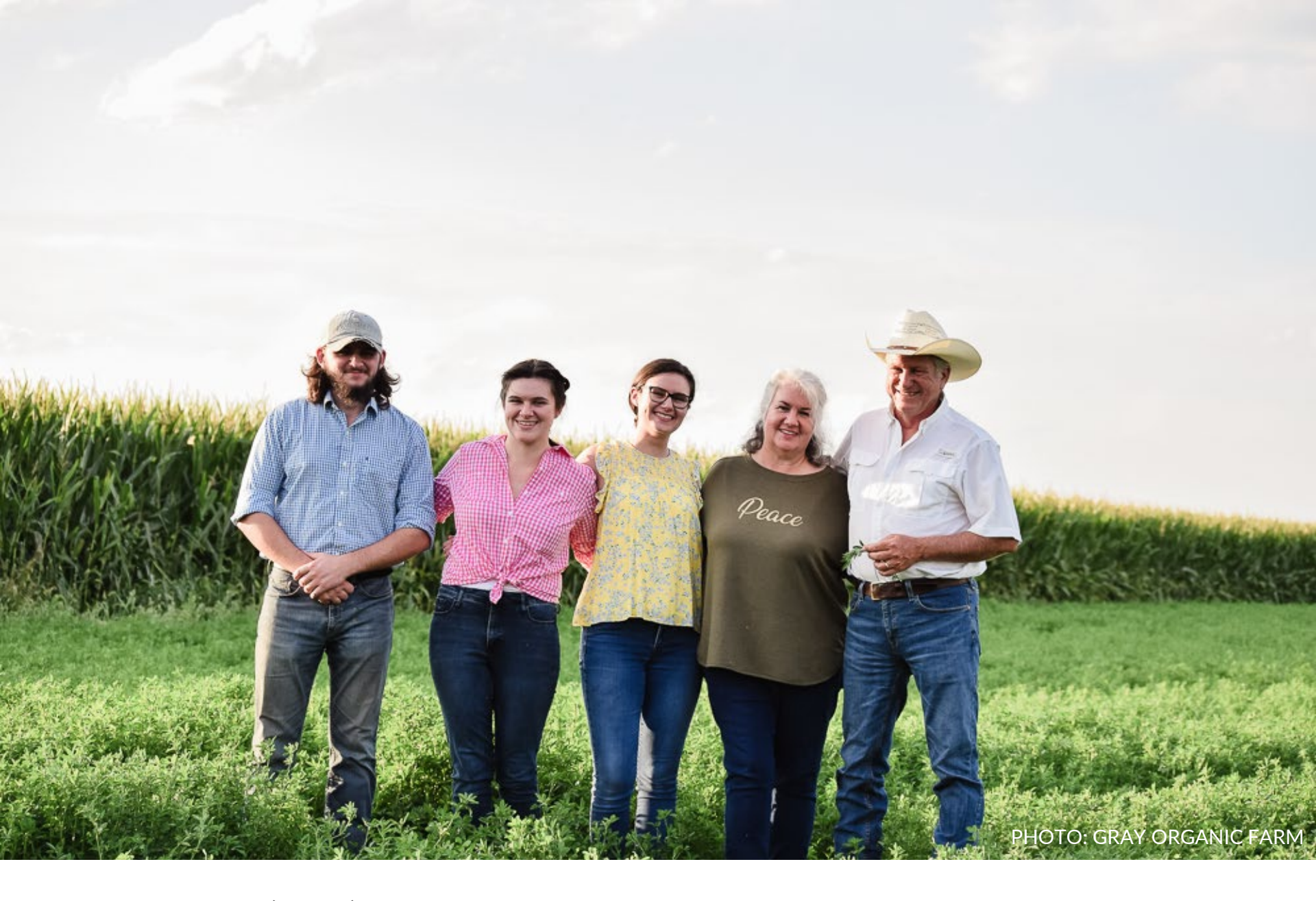
Harvest Table Foods (Illinois) – The Gray family is proud to offer ethically farmed and pastured-raised whole turkeys and additional meats from their organic farm in Central Illinois. Check out their website <a href="here">here</a>.