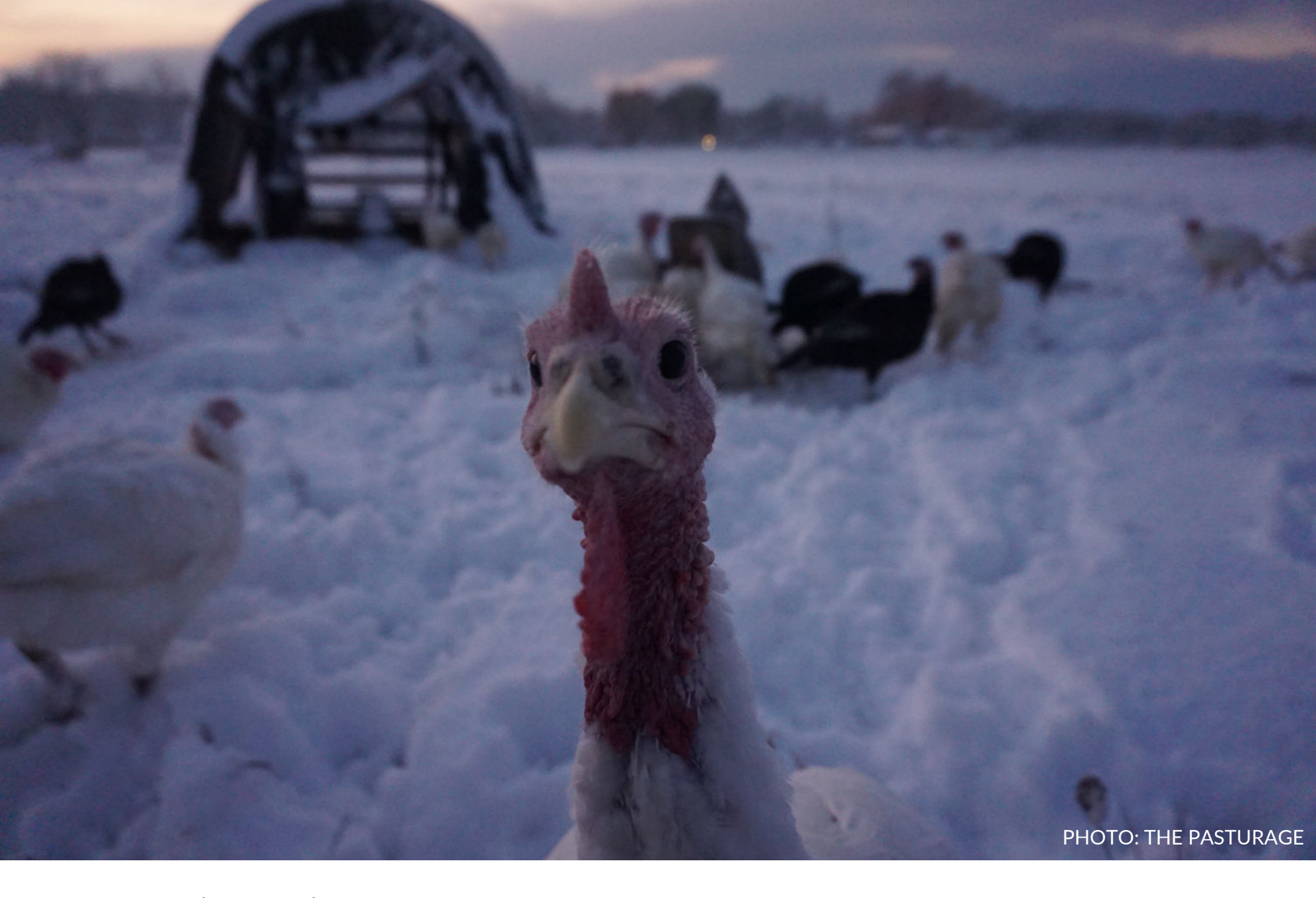
The Pasturage (Michigan) – Turkey, lamb, pork, and more available in the online pre-order form! Local pick-up only. The link for the online pre-order form is here.